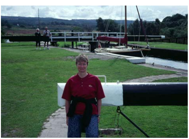
Back Breaking Work

Although it would have been tempting to spend a day or so