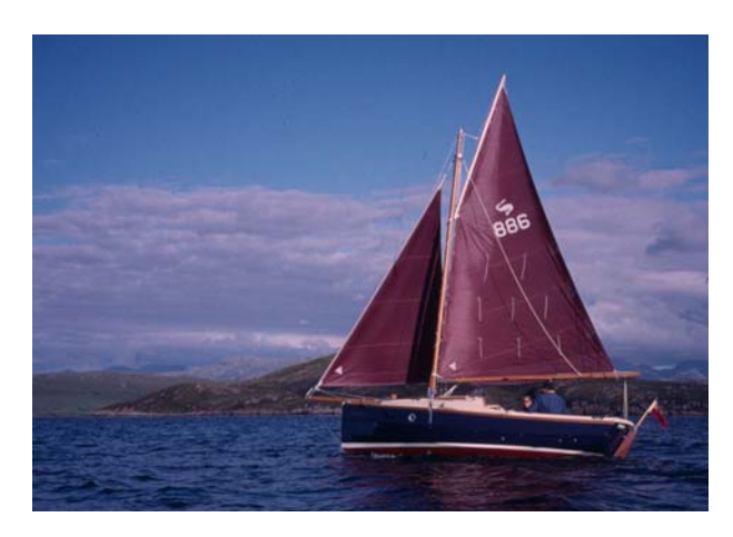
Fine sailing in Loch Shuna

recovering from these exertions in Crinan, we were keen to press on and get through the Dorus Mor tidal race and the potentially exposed Firth of Lorne whilst the weather remained calm; a decision that was vindicated 2 days later when we were forced to spend 2 days stormbound in the sheltered waters of Loch Aline.