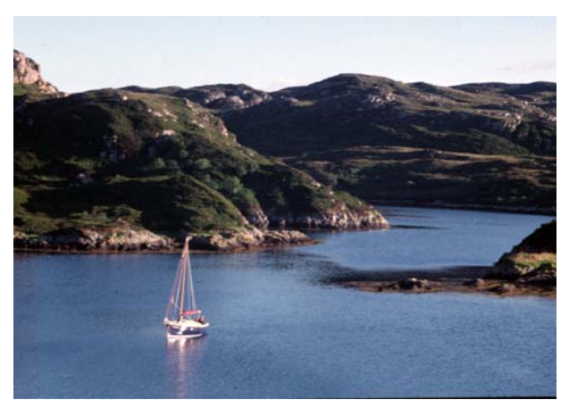
Another crowded West Coast anchorage

Point of Ardnamurchan well behind us, Muck and Eigg on our port beam, and the rock infested shores of the Sound of Arisaig on our starboard side. We had originally planned to spend several days exploring the many anchorages and harbours in this area, described in the pilot as "one of the most navigationally challenging" on the entire West Coast. However, whilst these anchorages would have offered us a safe haven in the forecast gales, we knew that once we were in them there would be no chance of escaping until long after the gales had passed and the sea state had subsided. We therefore reluctantly opted to continue heading northwards towards the harbours of the Knoydart Peninsula and Sound of Sleat, which would leave us more options in the unsettled weather that lay ahead.