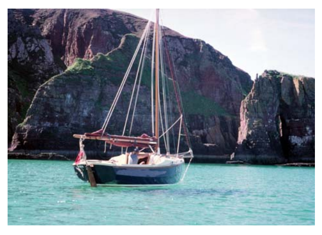
Another idyllic anchorage

The passage northwards through the inner sound to Rona, where we anchored overnight before heading up to Loch Ewe, was more reminiscent of cruising in the West Indies that the West Coast of Scotland. The highlight of the entire cruise came when we discovered a splendid bay in which to anchor for lunch just east of Rubha Reidh at the entrance to Loch Ewe. Although not