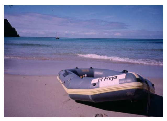
Private tropical Beach

In the days that followed, we took the opportunity of short breaks in the weather to slowly work our way northwards via the Kyle of Lochalsh to the delightful town of Plockton. There we were joined by a 3<sup>rd</sup> crew member who had fetched our boat trailer up from Inverkip. By now we were enjoying the benefits of a persistent ridge of high pressure and days of our cruise 12 remaining, we made the decision to sail northwards as far as Loch Ewe before returning to Kyle of Lochalsh where we would be lifted back onto the trailer.