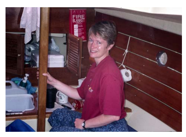
Home for the next 4 weeks – you must be joking!!

Moreover we were determined to prove that cruising in this wildly beautiful area need not be the sole preserve of those in possession of a large heavy displacement yacht. Armed with nothing bigger than our newly acquired 19' Cornish Shrimper and road trailer, we hatched an ambitious plan to cruise almost the entire length of the Scottish West Coast during the summer of 2002. As I described the plan to various sailing friends in the months leading up to the trip, I almost always came away with the impression that they thought I had finally lost my marbles; although of course they were all too polite to say this to my face!