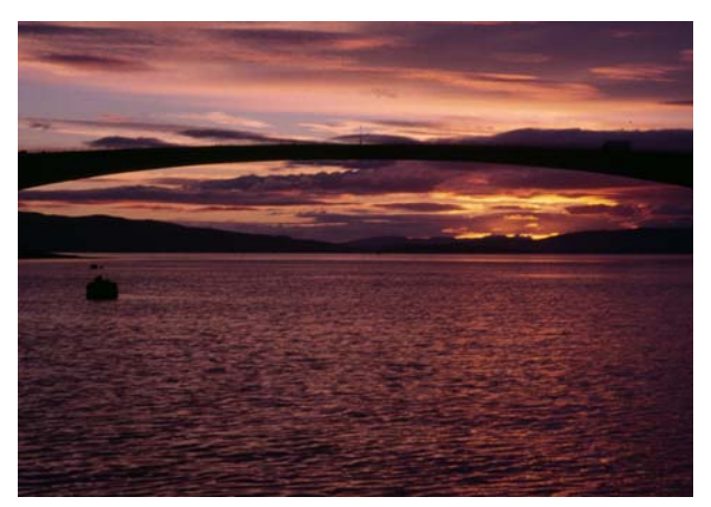
Sunset over the Skye bridge

imminent. The following morning we motored over to Inverie to seek some local