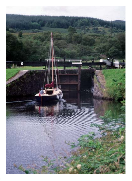
Heading for the Western Isles

The west coast of Scotland is not a place for the faint hearted. Anyone flicking through a vachtsman's pilot for the immediately confronted with intimidating descriptions of unmarked rock strewn passages, 8 knot+ tidal races and some of the roughest and most exposed headlands in Add to this a well the British Isles. deserved reputation for truly awful weather and you might be forgiven for thinking that only the most determined of masochists would venture out into its waters for However, rich rewards await pleasure. those who are prepared to take on the challenges of sailing in the area. The splendour of the scenery is a match for anything in the world, and its wild and isolated anchorages are the perfect panacea those seeking respite from overcrowded and overpriced marinas of the South Coast of England.