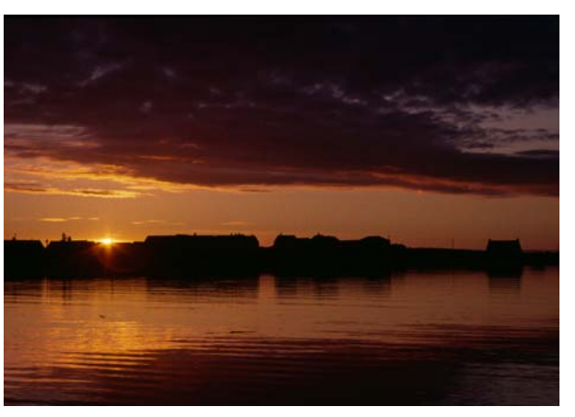
Sunset in Loch Ewe

However, our luck with the weather finally ran out and on reaching Isleornsay in time for a pub lunch, the midday shipping forecast convinced us that it was time to turn